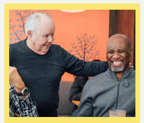
WEDNESDAY WORD: Bible study group for 60+ Wednesdays from 10:30am